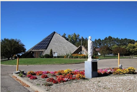
St. Peter Catholic Church

A large group of Germans from Russia originally from the Kuchurgan settled on the Sioux Indian Reservation when the government opened it up for homesteading. Many of them crossed the frozen Missouri River with their teams pulling loaded wagons to find homesteads. The Black Sea Germans from Russia living on the Reservation incorporated many of the Sioux practices. They began to dry their garden products much as the Sioux did and hung their corn out to dry in front of their homes. They collected native plants that were used for healing and learned from each other; their traditions and beliefs.