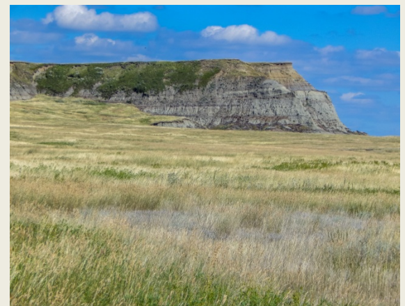
Stumpf Natural Area

As we travel south towards Fort Yates, enjoy the beautiful scenery along the way and hear about the history of the small towns and other historic sites until we reach Fort Yates. There we will do a on-bus city tour and visit St. Peter Catholic Church and Cemetery. Following the visit to Fort Yates, we will make a lunch stop at Prairie Knights Casino as we return to Mandan.